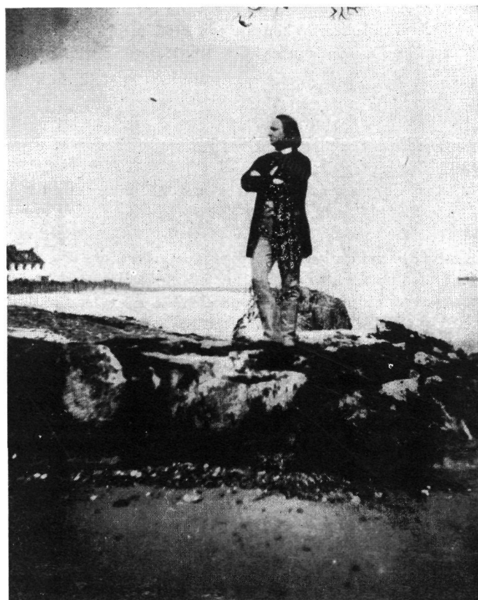
VICTOR HUGO, posing for one of the pictures in the album which contains a photographic record of his life as an exile on the Island of Jersey.

The talented Hugo family had led a life in France full of social and patriotic activity, as well as intensive work in the fields of art and literature. Victor Hugo was able to use much of his energy while in exile writing, but Charles Hugo and Vacquerie found time hanging heavily on their hands. Photography offered a diversion in which everyone could participate. Charles journeyed to Caen where he studied with experts, and returned with some knowledge of the albumen process. Vacquerie mastered the techniques involved in using collodion. They were delighted with the simplicity of these processes compared with the complexities of making daguerreotypes. Friends sent the necessary materials. The two "operators" became proficient in handling their tools, and Hugo's imagination leaped quickly to the potentialities of this new "sun painting." The album con-